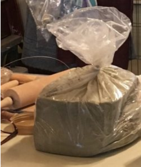
Block of unformed clay

Now we don't live close to each other, so I haven't seen her at work, but I can imagine her hands sculpting a big lump of clay into exactly the form that she wants it to take. Sharp tools are needed to add intricacies of form and personality. As I zoomed in on the photos I could see all the amazing detail work that gives life to each of her pieces.