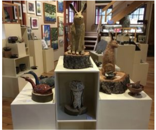
My friend's work

Thanks for listening! May your soul's meditations be fuel for Spirit-led actions today.