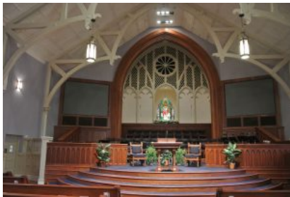
Parker Memorial Baptist Church in Anniston, Alabama.