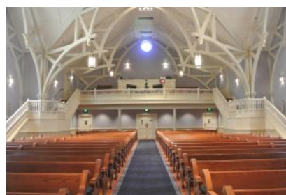
Stunning Parker Memorial Baptist Church in