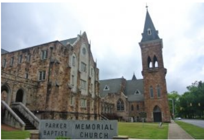
Parker Memorial Baptist Church