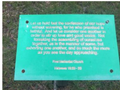
From an outdoor prayer walk at Lake Eufaula Campground in Eufaula, Alabama.