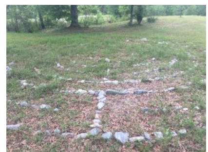
Stone prayer labyrinth at Lake